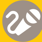
Shows and star acts