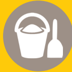
On the beach