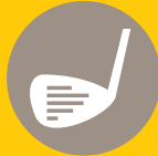
9-hole golf course